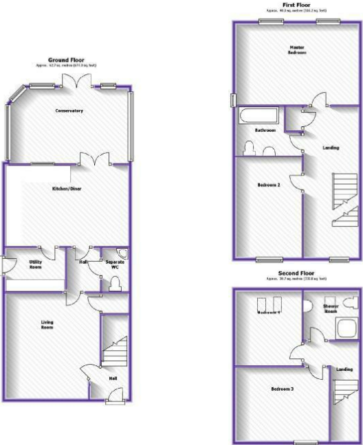
Total area: approx. 279 sq. metres (2923 sq. feet)